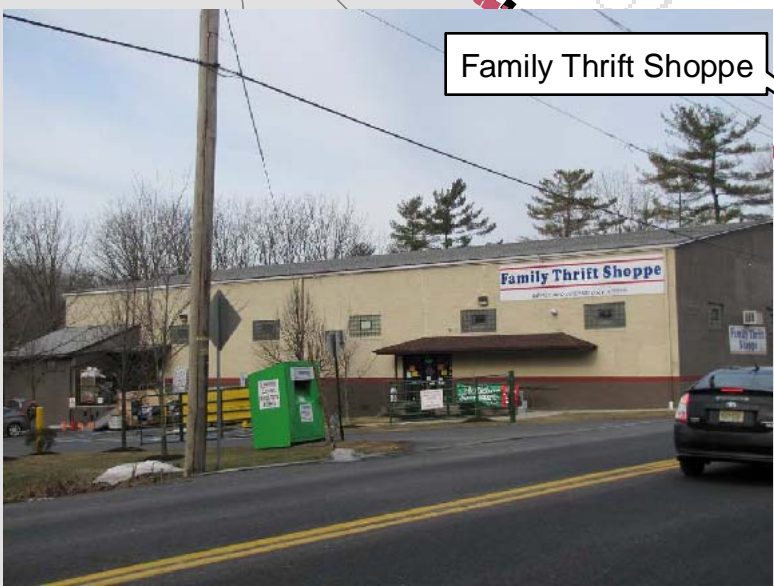
Family Thrift Shoppe