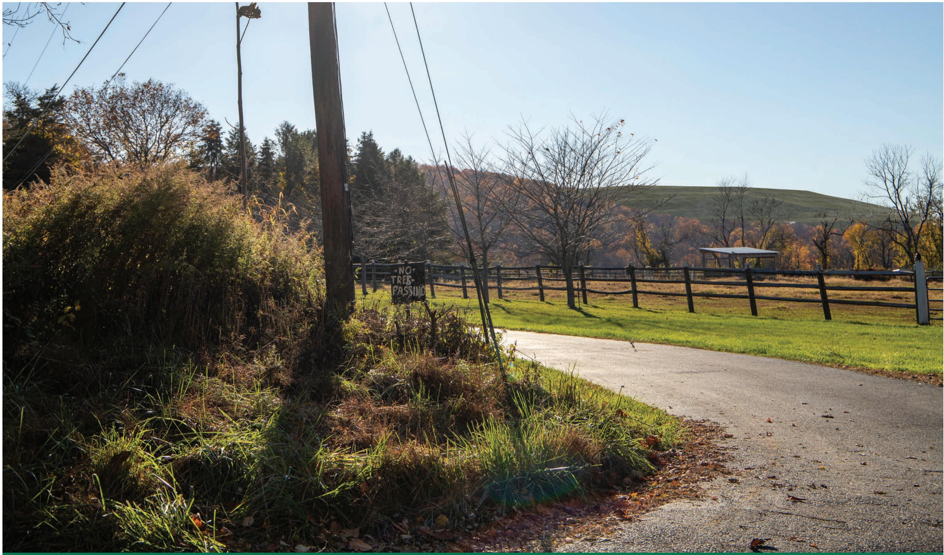
SIMULATED CONDITION: PROPOSED EXPANSION (Final Cover) Photo 14: Redington Rd. near #2626 Distance to proposed landfill ridge: 0.81 miles