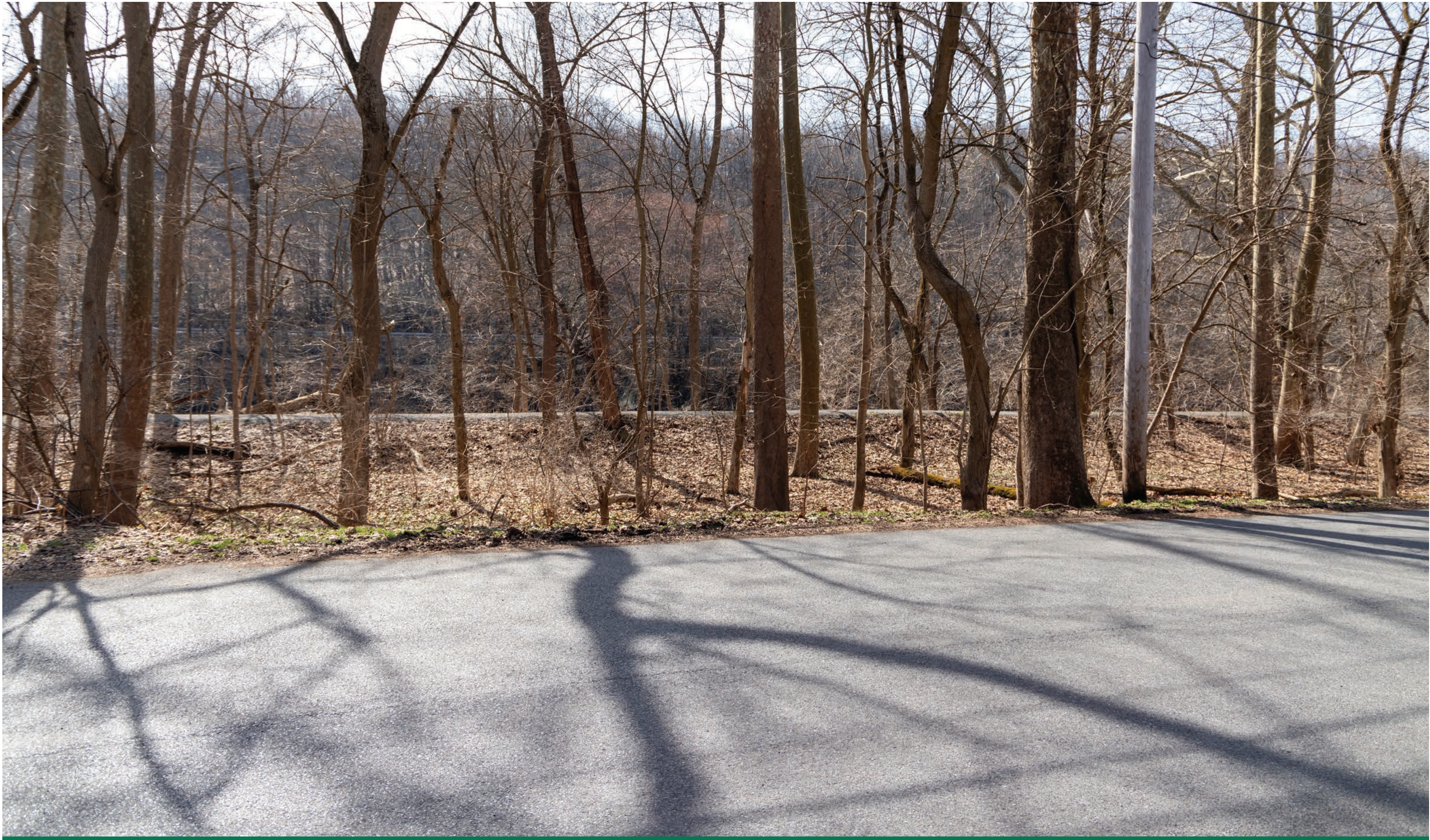
EXISTING CONDITION VIEW Photo 13: Delaware & Lehigh Trail - Farmersville Road Trailhead Distance to proposed landfill ridge: 0.52 miles