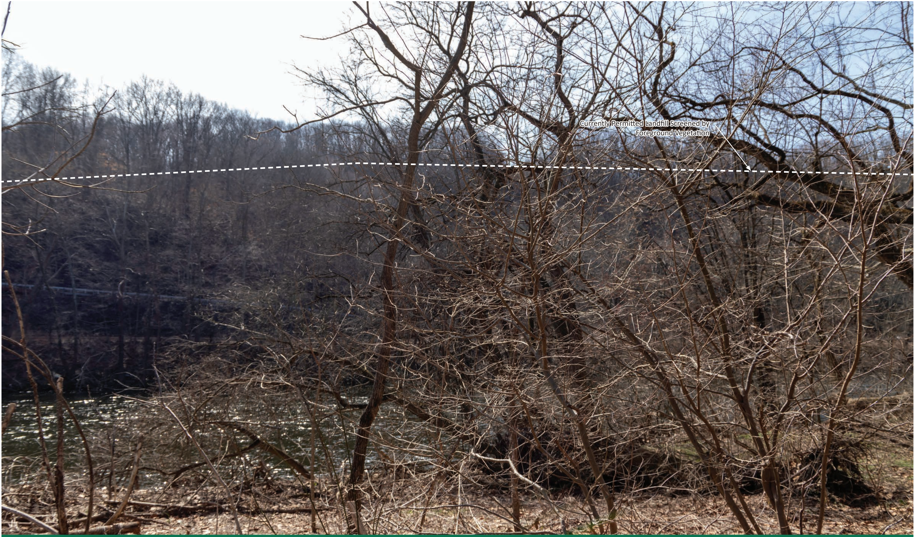
SIMULATED VIEW: CURRENTLY PERMITTED CONDITION (Final Cover) Photo 12: Delaware & Lehigh Trail Distance to proposed landfill ridge: 0.44 miles