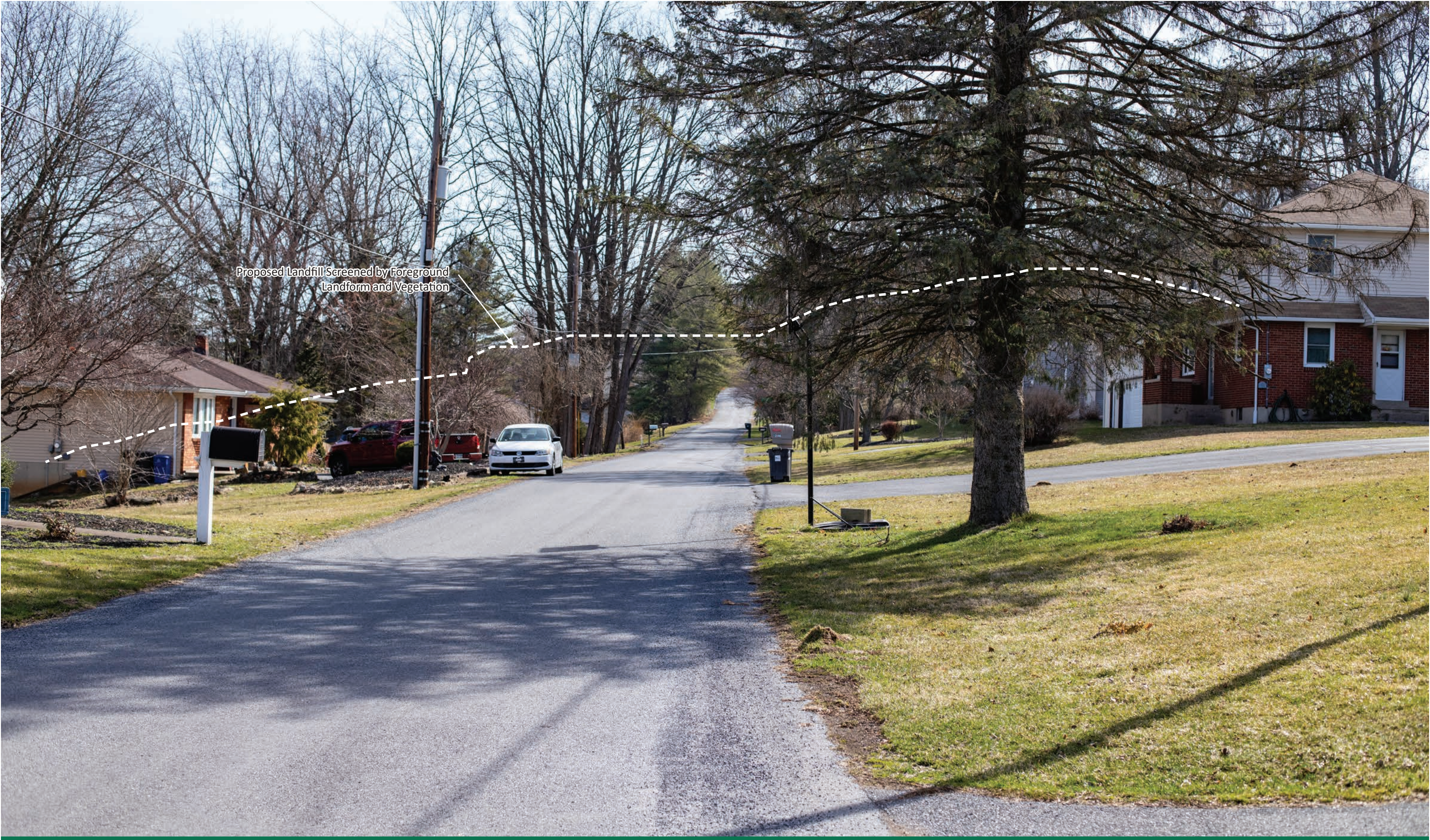
SIMULATED CONDITION: PROPOSED EXPANSION (Final Cover) Photo 09: SE Corner Steel City Church Property (Mixsell Ave. near Fritz Ave) Distance to proposed landfill ridge: 0.72 miles