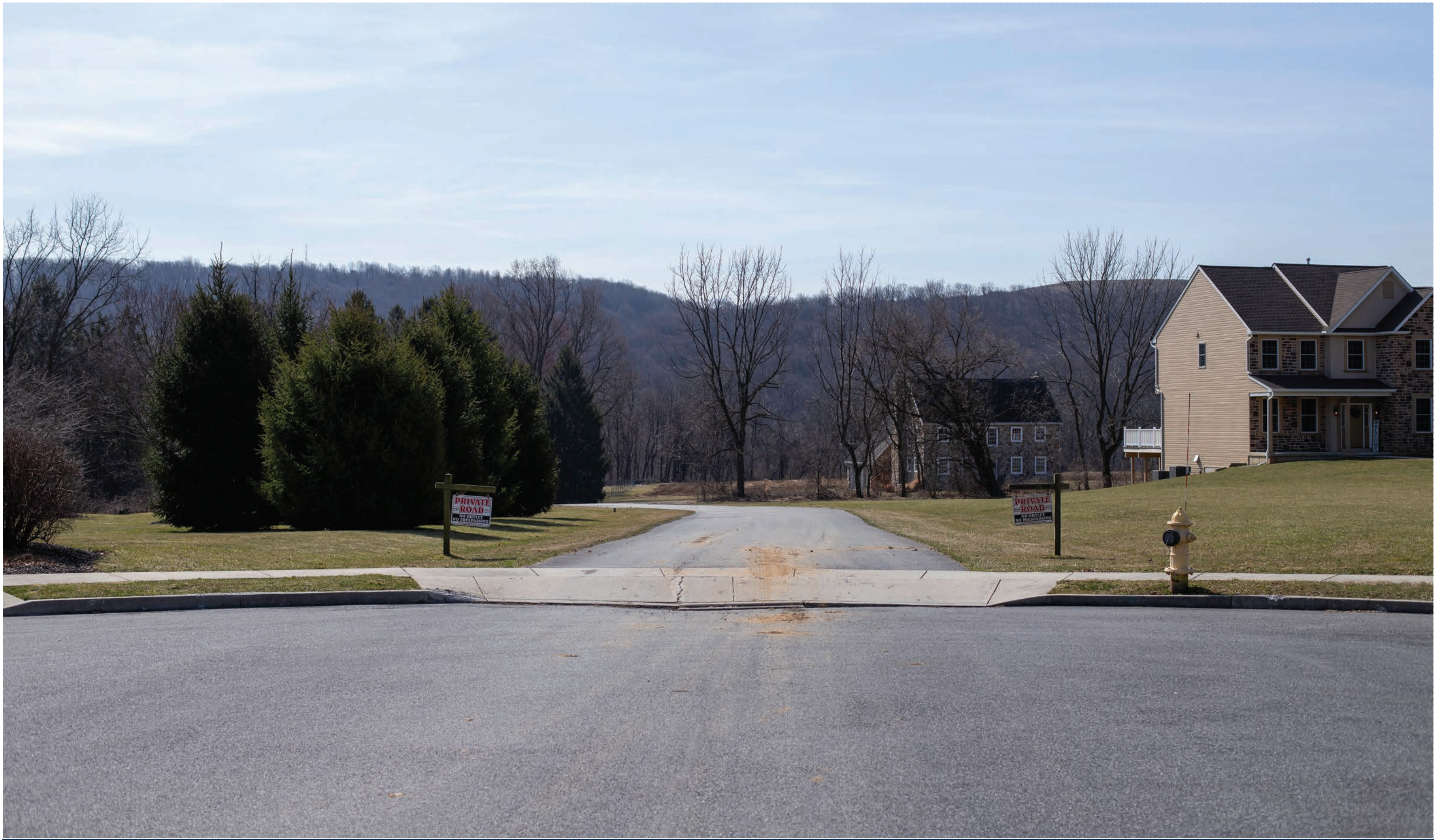
EXISTING CONDITION VIEW Photo 06: Chardonay Dr. at cul-de-sac Distance to proposed landfill ridge: 0.92 miles