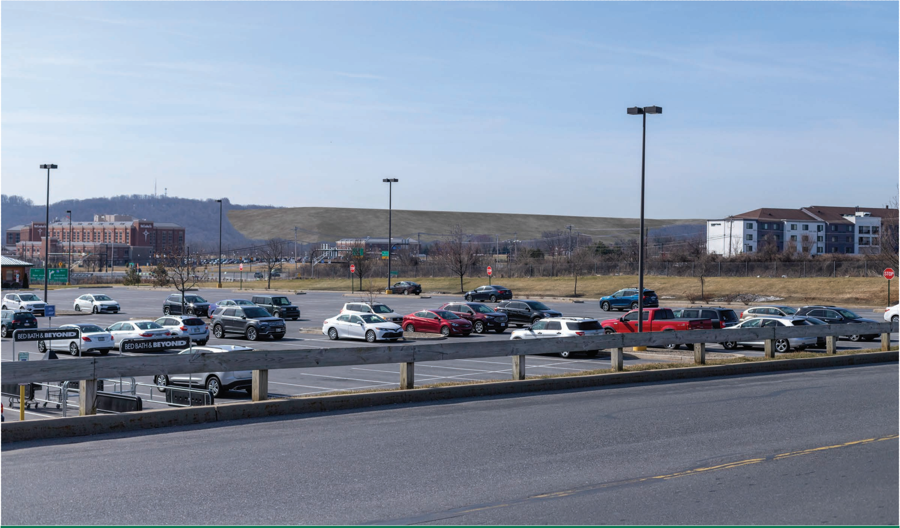
SIMULATED CONDITION: PROPOSED EXPANSION (Final Cover) Photo 04: Birkland PL near Lowes Home Improvement Distance to proposed landfill ridge: 1.94 miles