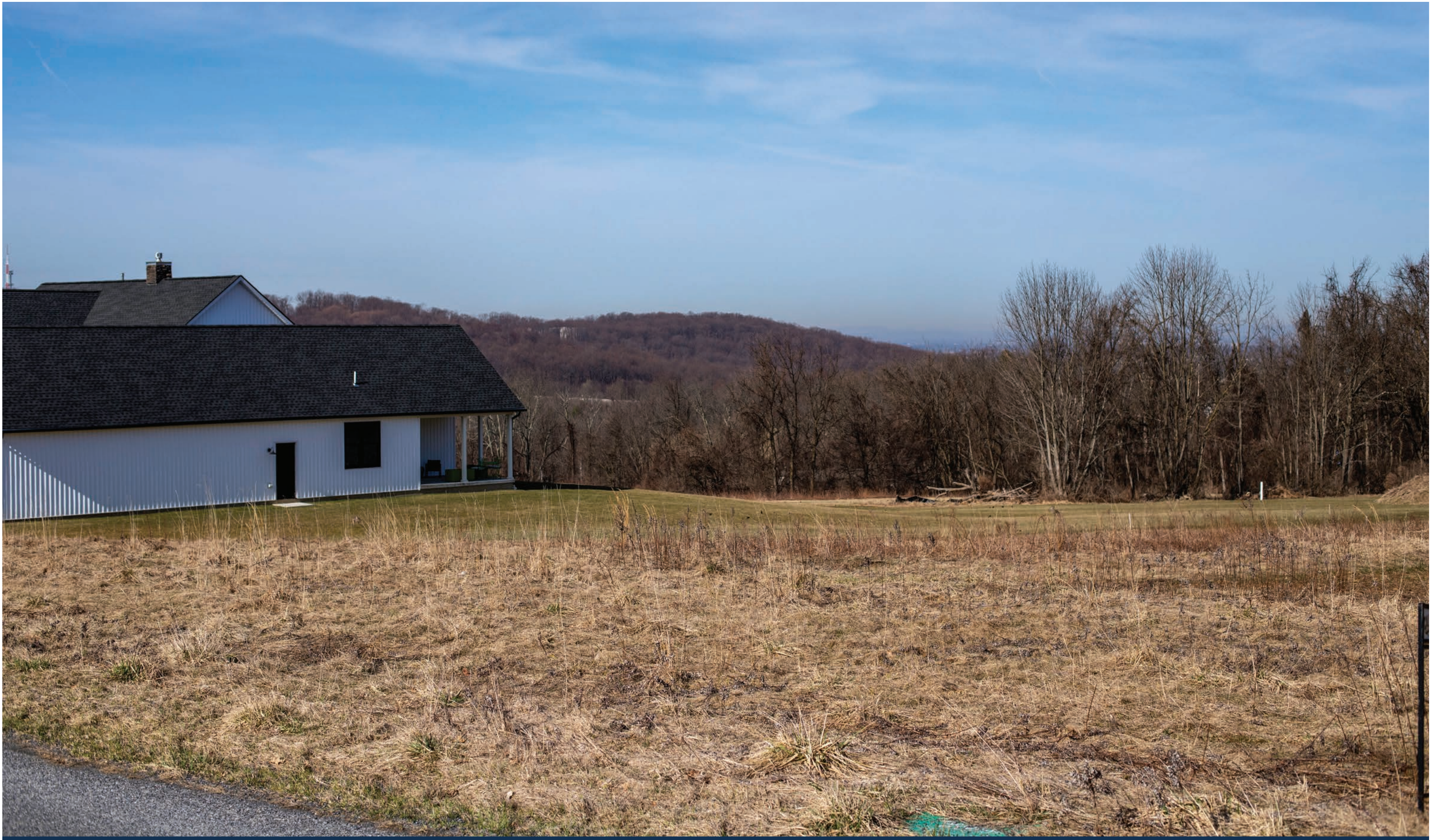
EXISTING CONDITION VIEW Photo 15: Texas Rd. near #880 Distance to proposed landfill ridge: 1.58 miles