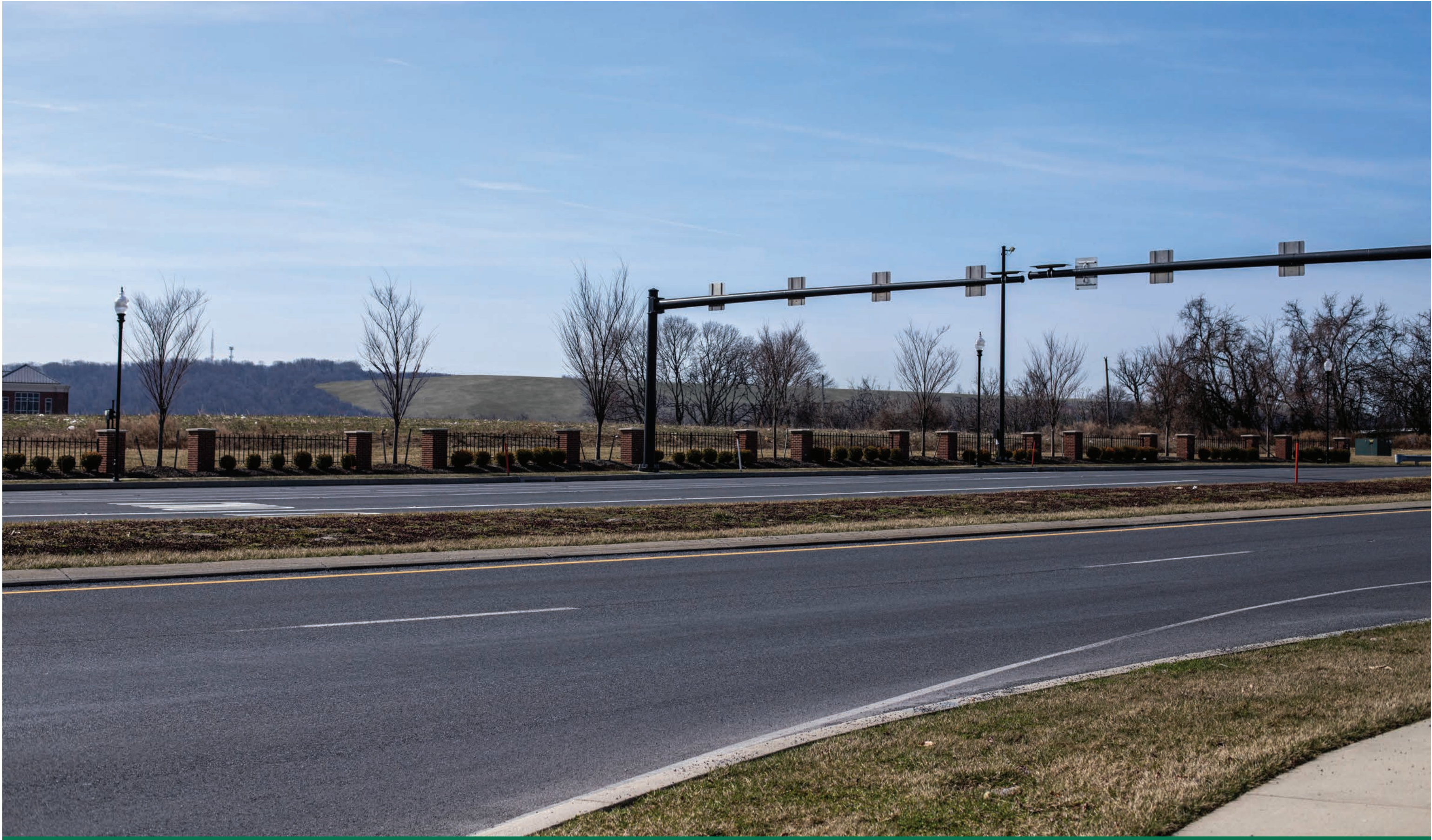
SIMULATED CONDITION: PROPOSED EXPANSION (Final Cover) Photo 03: Freemansburg Ave at Emrick Blvd Distance to proposed landfill ridge: 1.60 miles