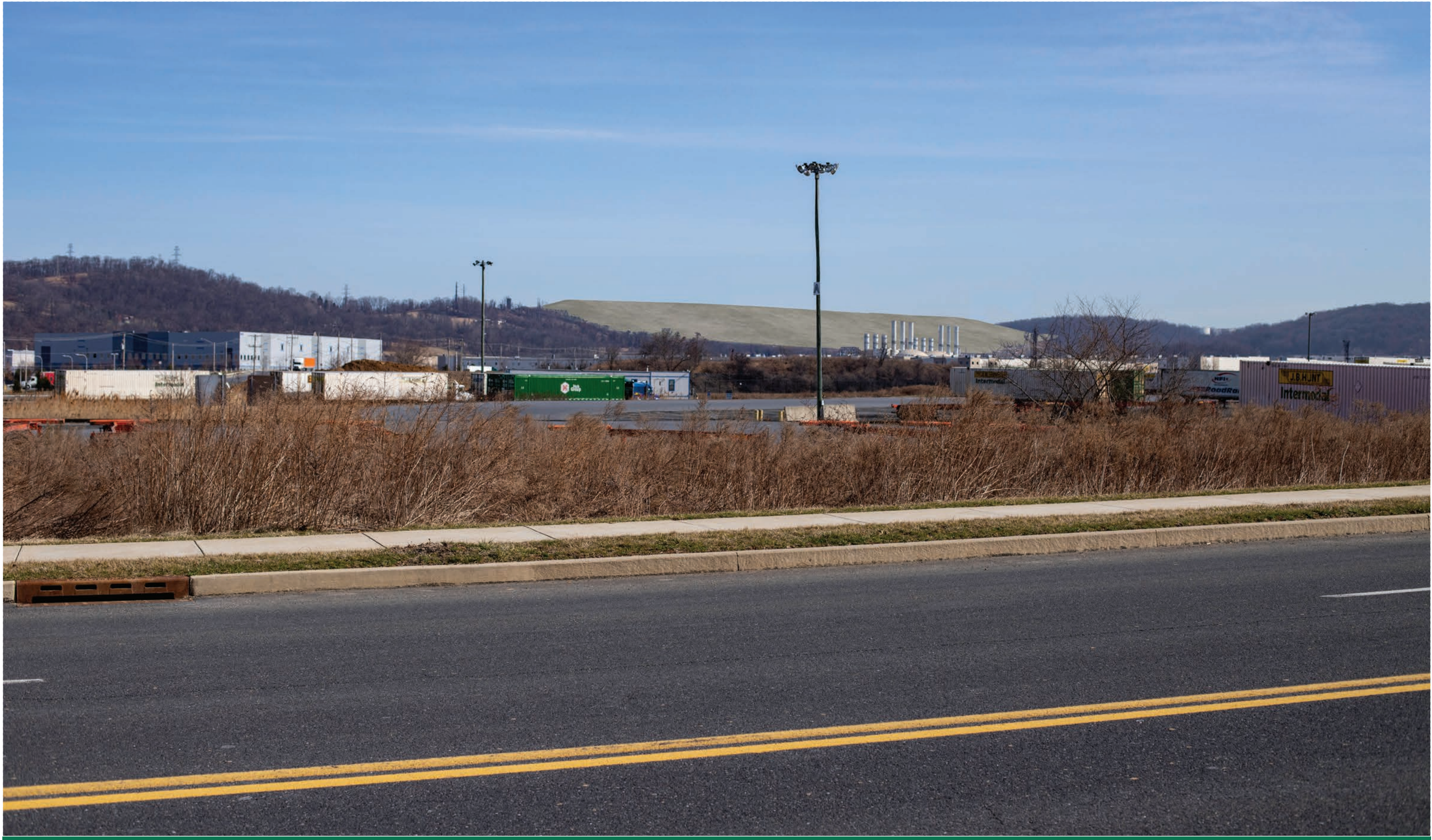
SIMULATED VIEW: CURRENTLY PERMITTED CONDITION (Final Cover) Photo 16: Gilhrst Dr near Harvard Ave Distance to proposed landfill ridge: 2.10 miles