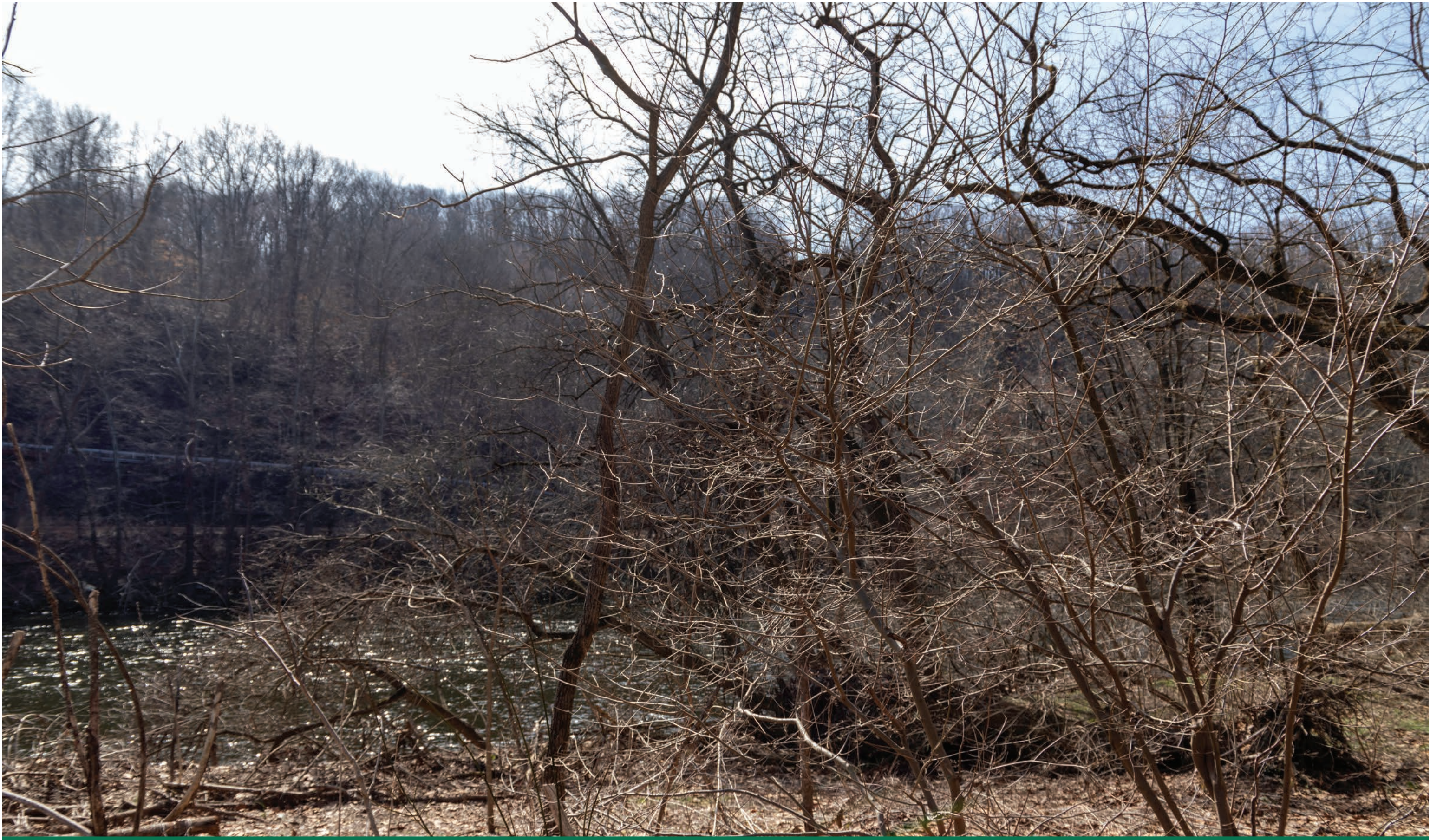
EXISTING CONDITION VIEW Photo 12: Delaware & Lehigh Trail Distance to proposed landfill ridge: 0.44 miles