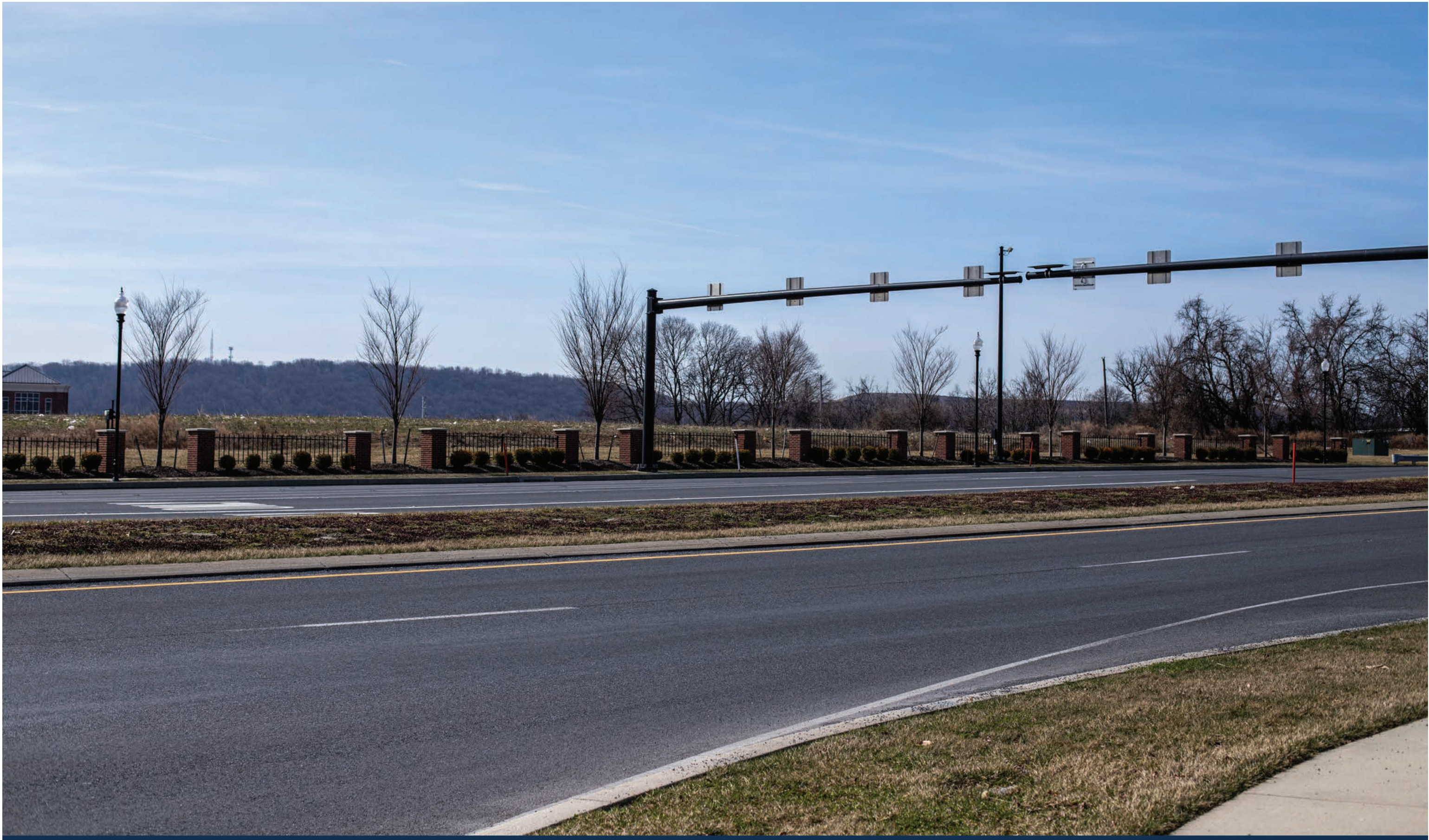
EXISTING CONDITION VIEW Photo 03: Freemansburg Ave at Emrick Blvd Distance to proposed landfill ridge: 1.60 miles