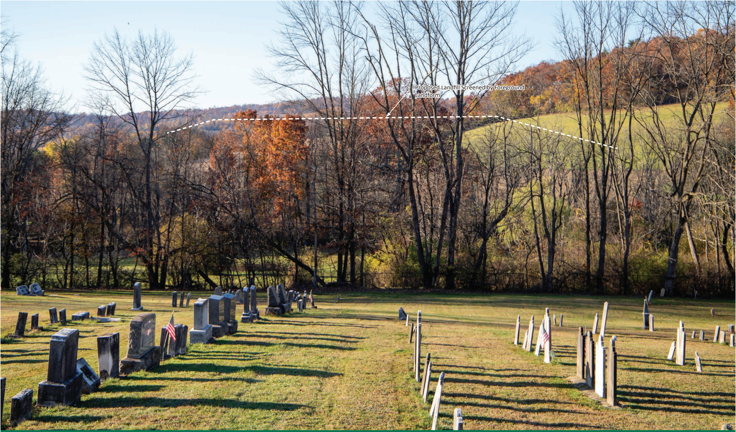
SIMULATED CONDITION: PROPOSED EXPANSION (Final Cover) Photo 18: Saint Luke's Old William Lutheran Church Cemetery Distance to proposed landfill ridge: 2.51 miles