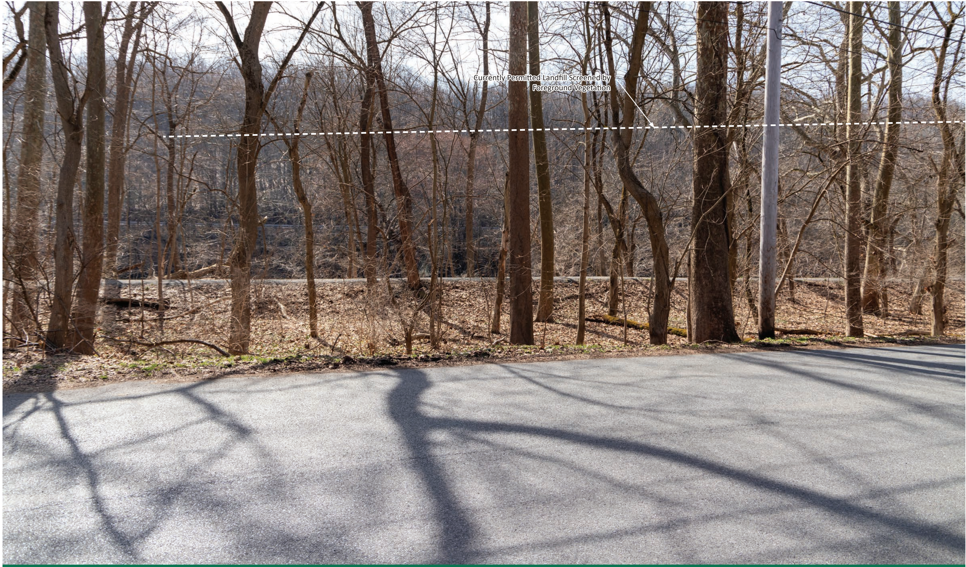
SIMULATED VIEW: CURRENTLY PERMITTED CONDITION (Final Cover) Photo 13: Delaware & Lehigh Trail - Farmersville Road Trailhead Distance to proposed landfill ridge: 0.52 miles