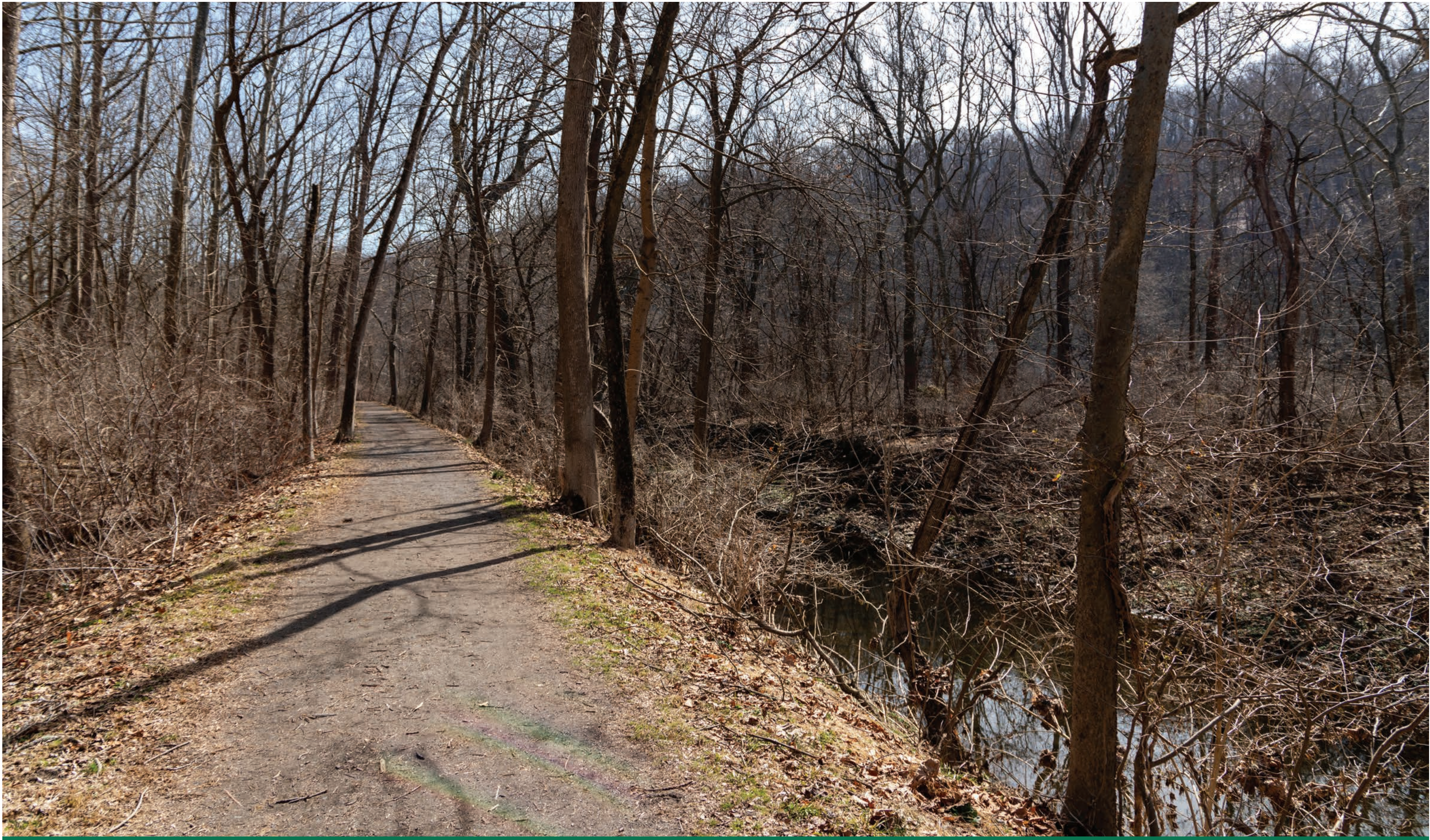
EXISTING CONDITION VIEW Photo 11: Delaware & Lehigh Trail Distance to proposed landfill ridge: 0.39 miles