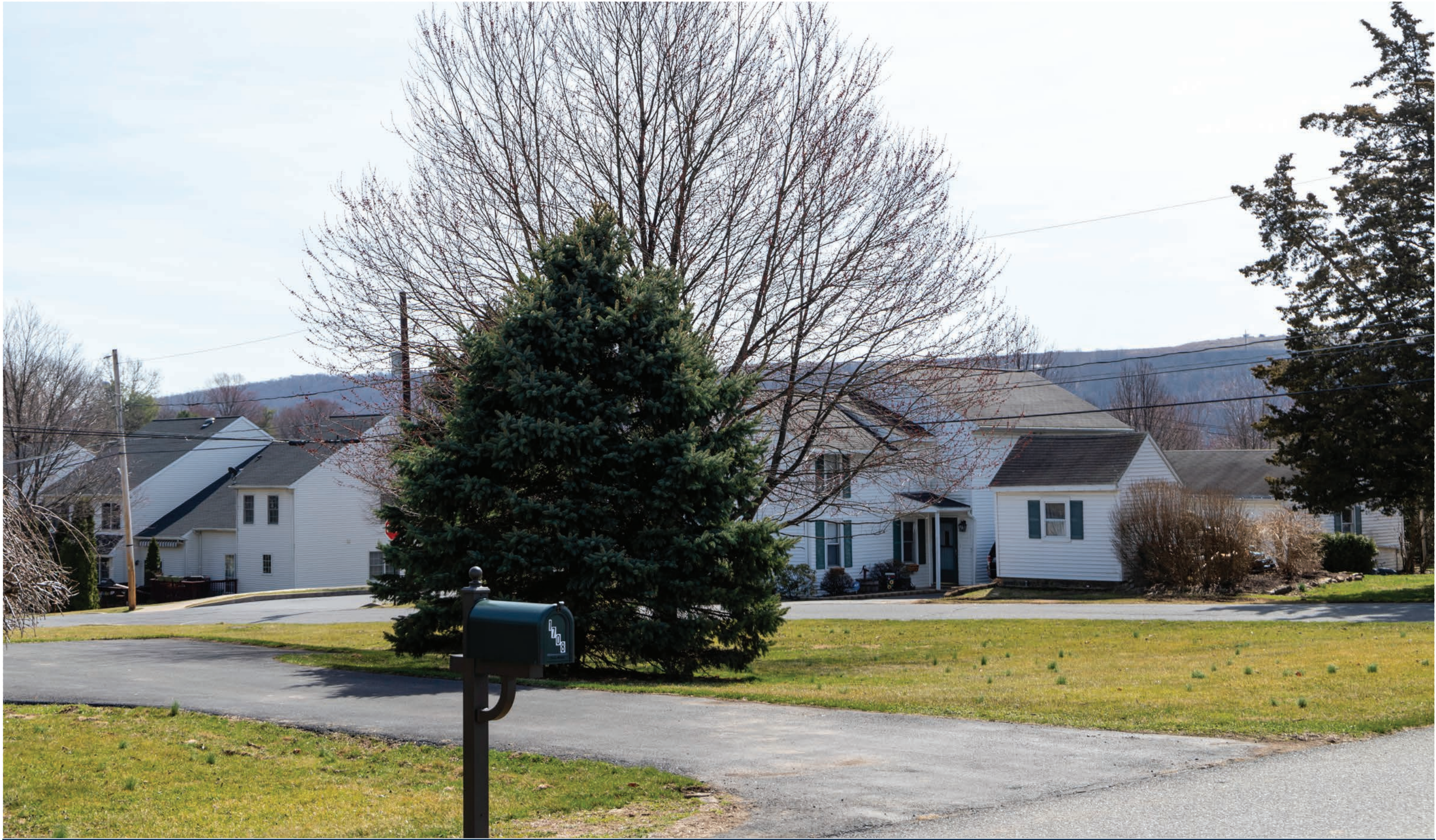
EXISTING CONDITION VIEW Photo 05: 9th St. near Washington St. Distance to proposed landfill ridge: 1.20 miles