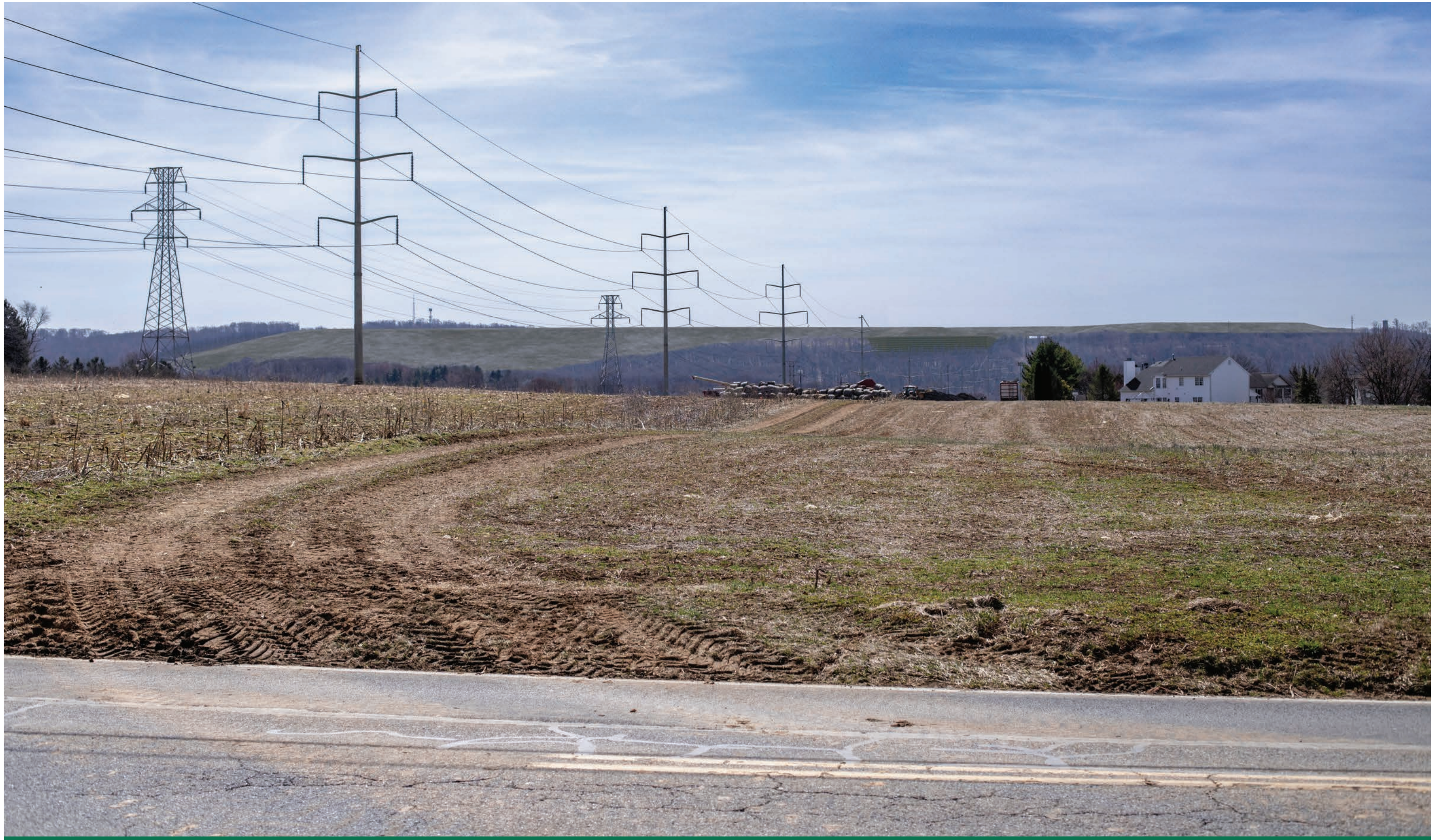
SIMULATED CONDITION: PROPOSED EXPANSION (Final Cover) Photo 02: Carter Rd at Sapphire Ln Distance to proposed landfill ridge: 1.95 miles