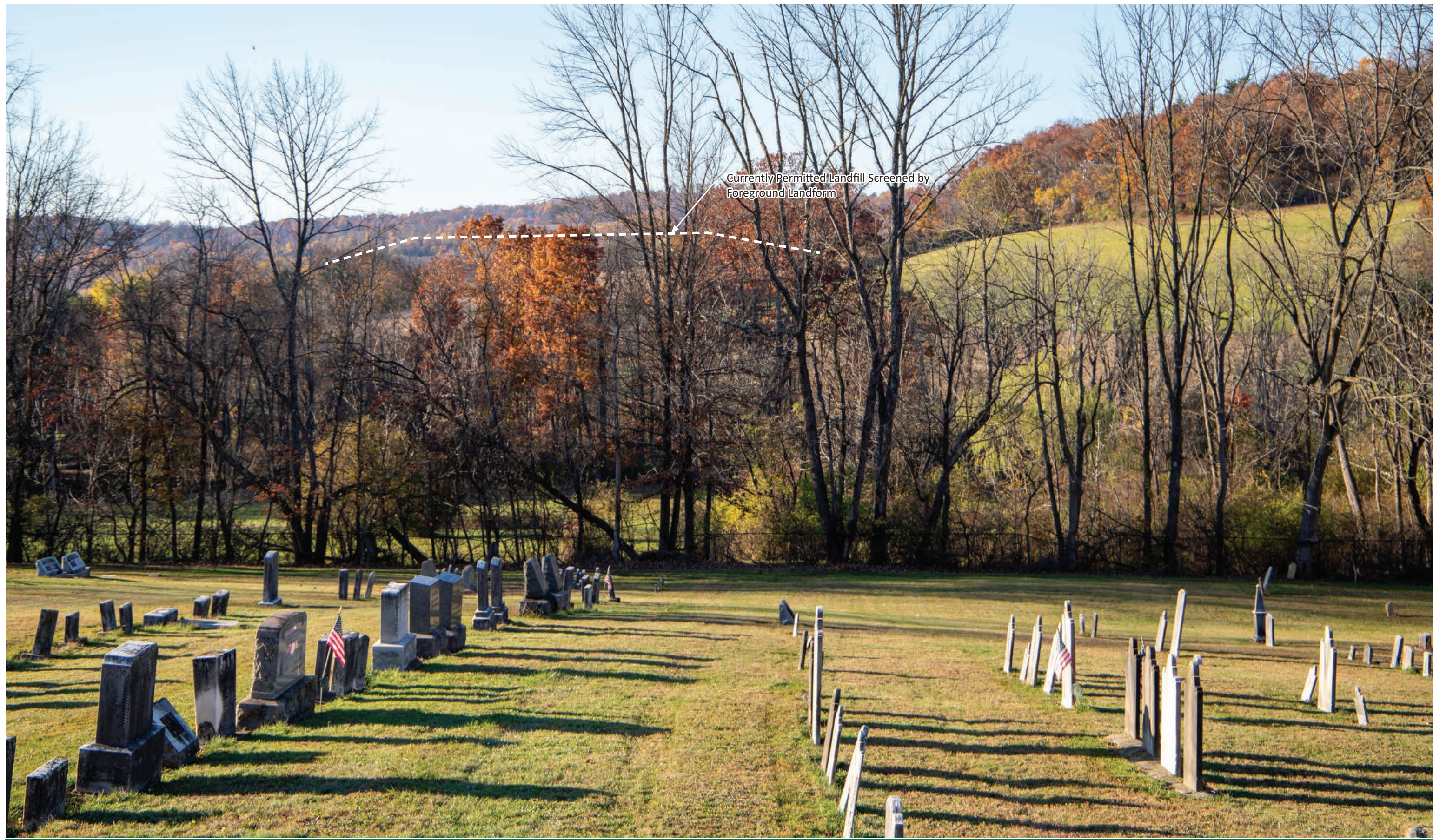
SIMULATED VIEW: CURRENTLY PERMITTED CONDITION (Final Cover) Photo 18: Saint Luke's Old Williams Lutheran Church Cemetery Distance to proposed landfill ridge: 2.51 miles