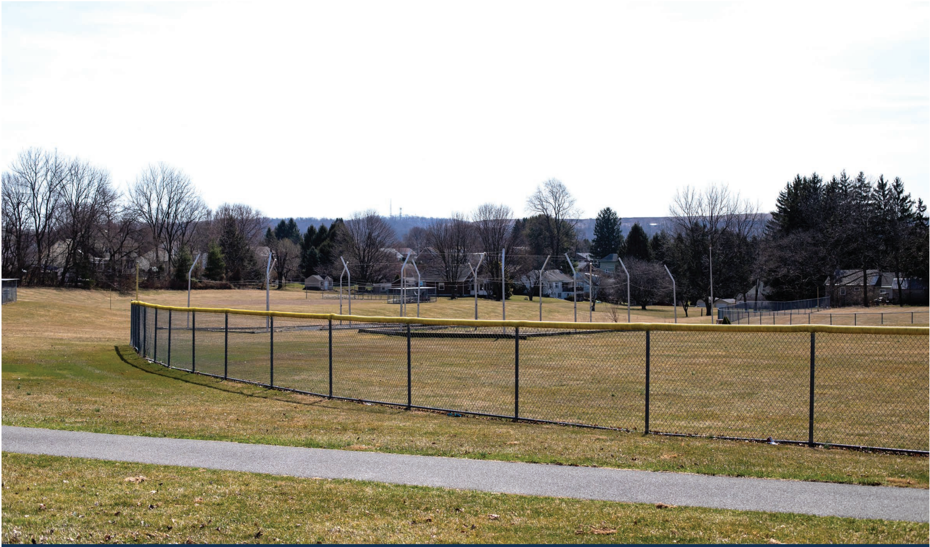
EXISTING CONDITION VIEW Photo 01: Klein St. at Miller Heights Elementary School Distance to proposed landfill ridge: 1.81 miles