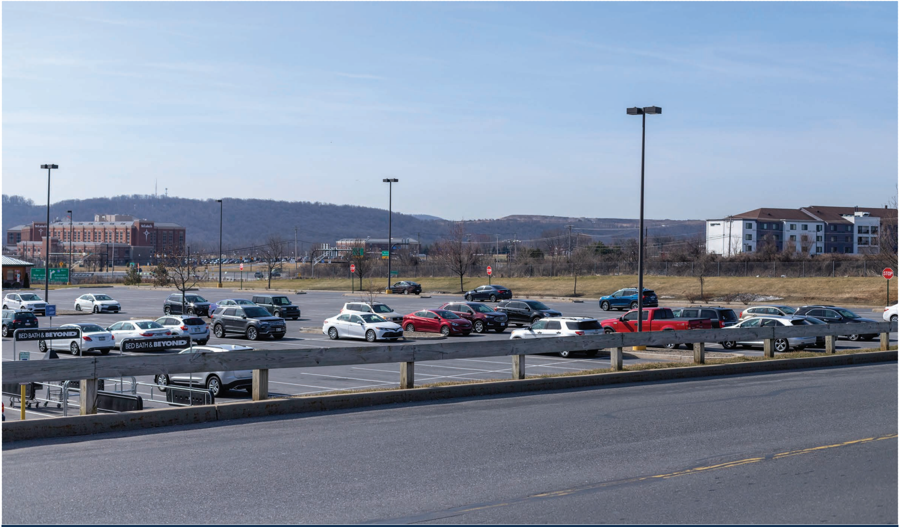
EXISTING CONDITION VIEW Photo 04: Birkland PL near Lowes Home Improvement Distance to proposed landfill ridge: 1.94 miles