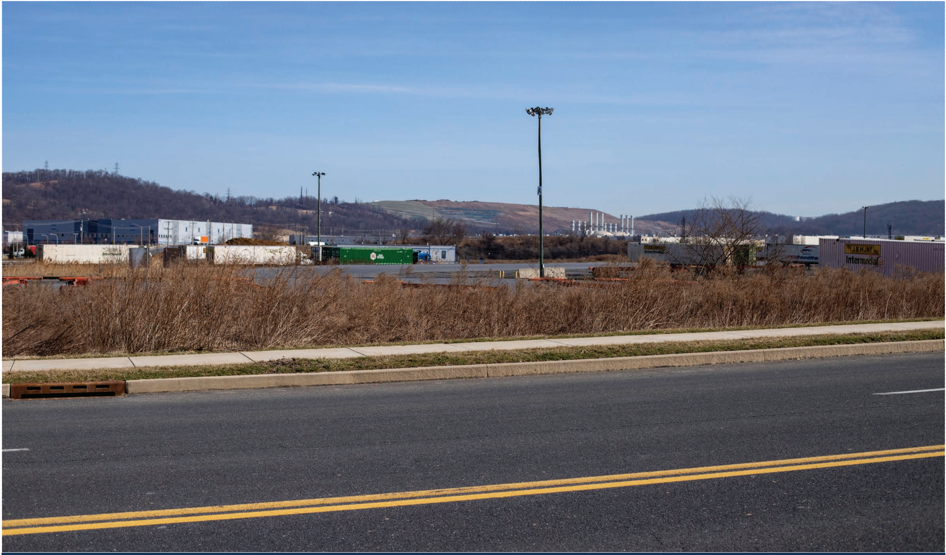
EXISTING CONDITION VIEW Photo 16: Gilhrst Dr near Harvard Ave Distance to proposed landfill ridge: 2.10 miles