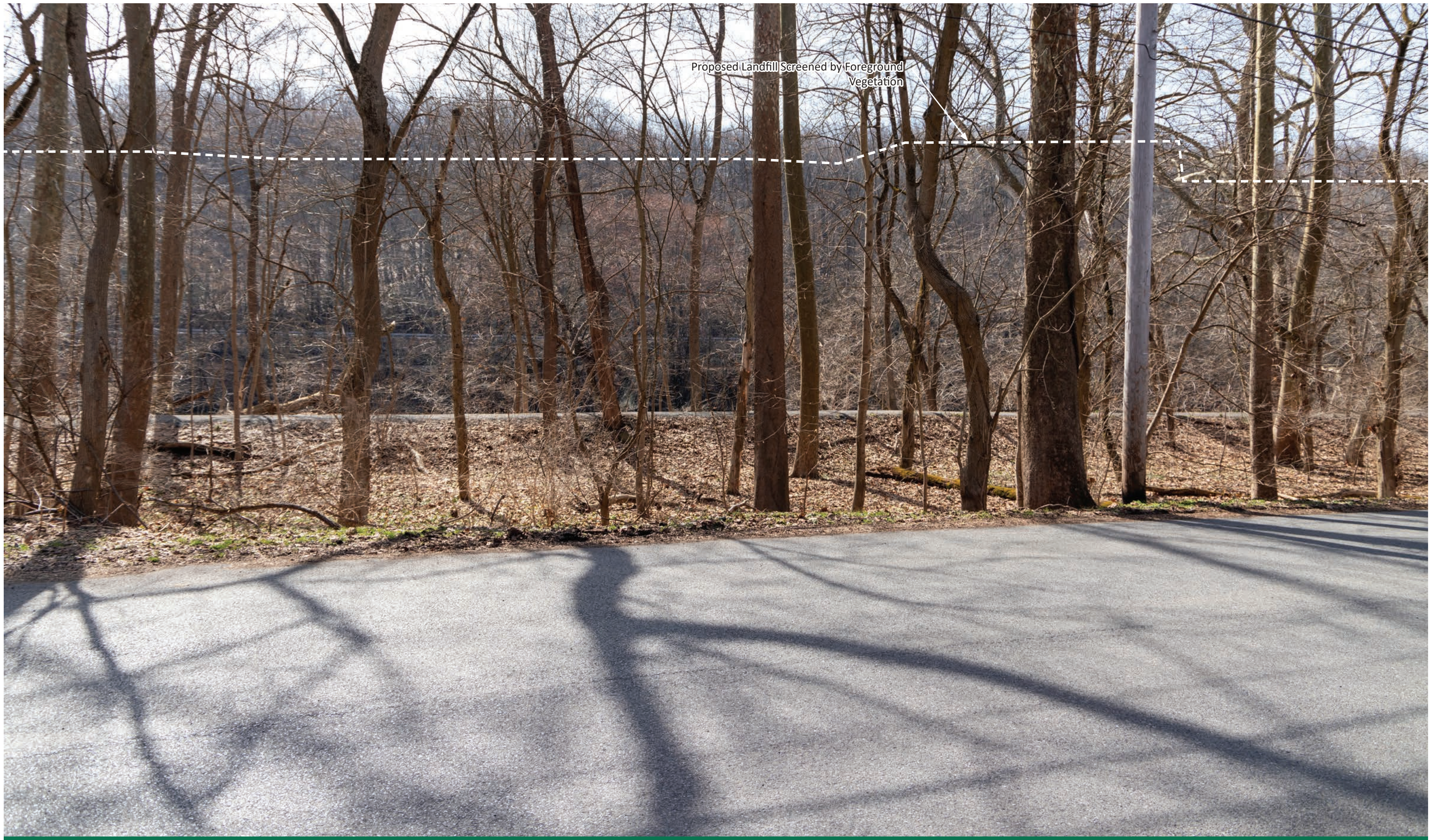
SIMULATED CONDITION: PROPOSED EXPANSION (Final Cover) Photo 13: Delaware & Lehigh Trail - Farmersville Road Trailhead Distance to proposed landfill ridge: 0.52 miles