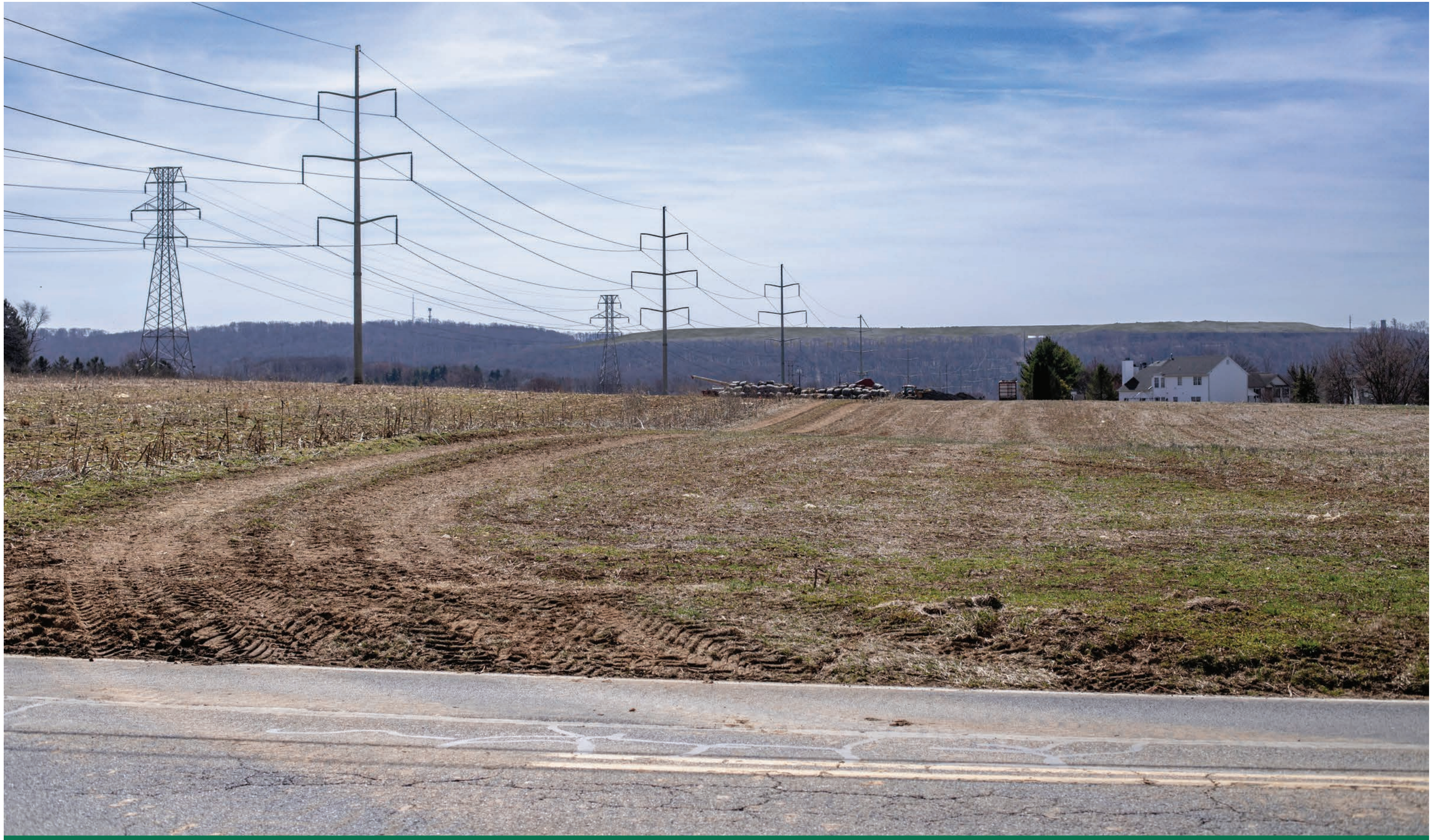
SIMULATED VIEW: CURRENTLY PERMITTED CONDITION (Final Cover) Photo 02: Carter Rd at Sapphire Ln Distance to proposed landfill ridge: 1.95 miles