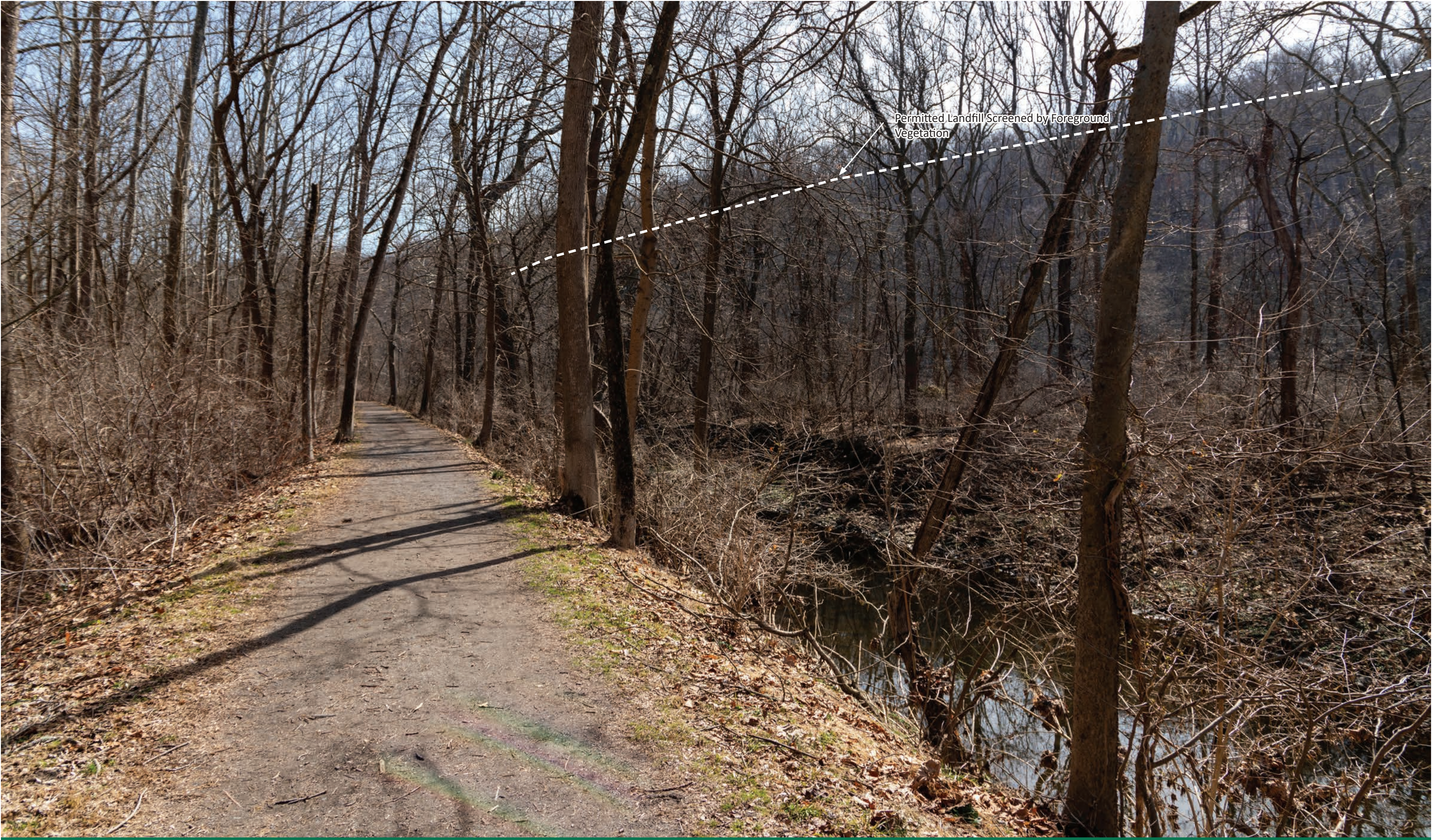
SIMULATED VIEW: CURRENTLY PERMITTED CONDITION (Final Cover) Photo 11: Delaware & Lehigh Trail Distance to proposed landfill ridge: 0.39 miles