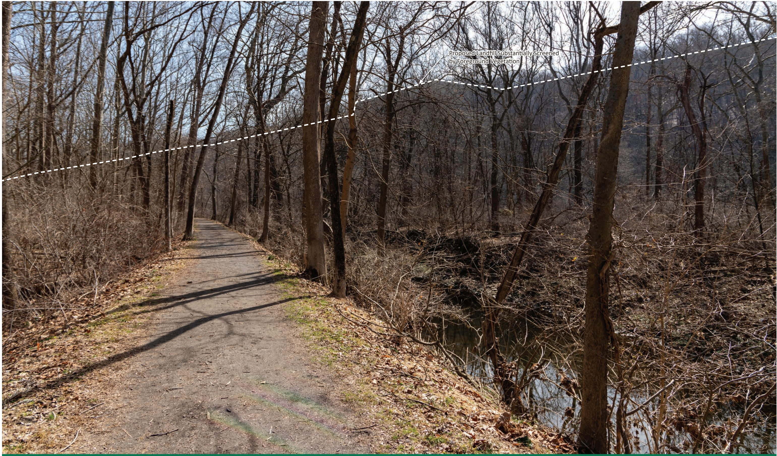
SIMULATED CONDITION: PROPOSED EXPANSION (Final Cover) Photo 11: Delaware & Lehigh Trail Distance to proposed landfill ridge: 0.39 miles