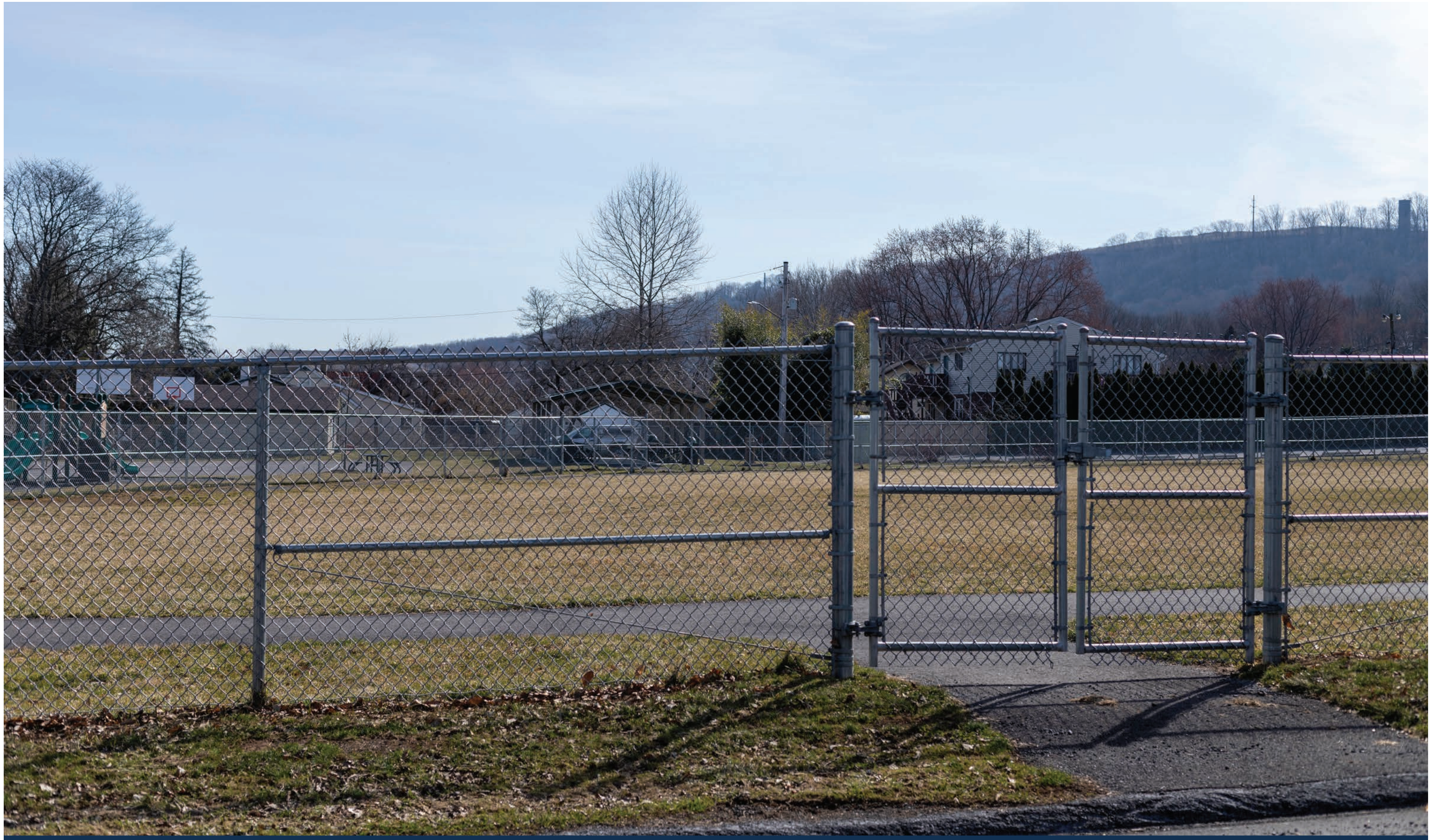
EXISTING CONDITION VIEW Photo 08: Matthews Ave. at Steel City Park Distance to proposed landfill ridge: 0.89 miles