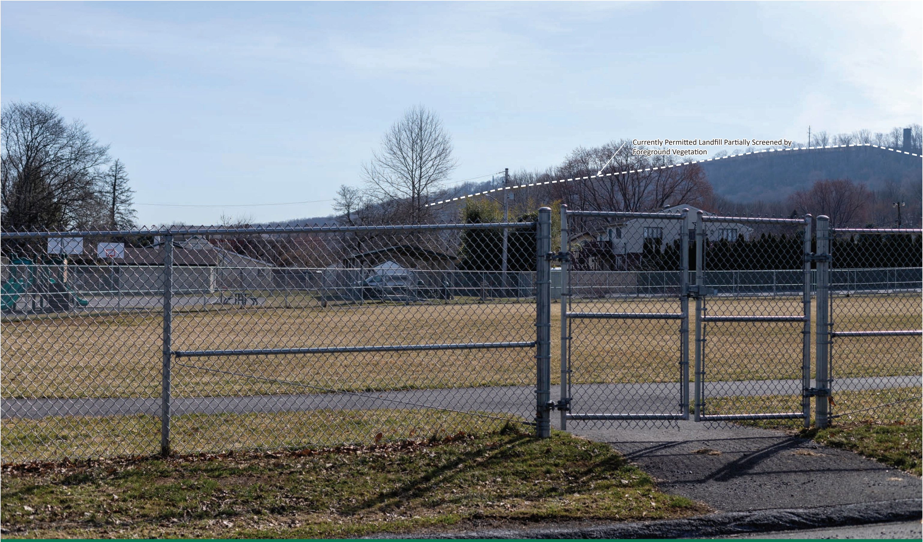
SIMULATED VIEW: CURRENTLY PERMITTED CONDITION (Final Cover) Photo 08: Matthews Ave. at Steel City Park Distance to proposed landfill ridge: 0.89 miles