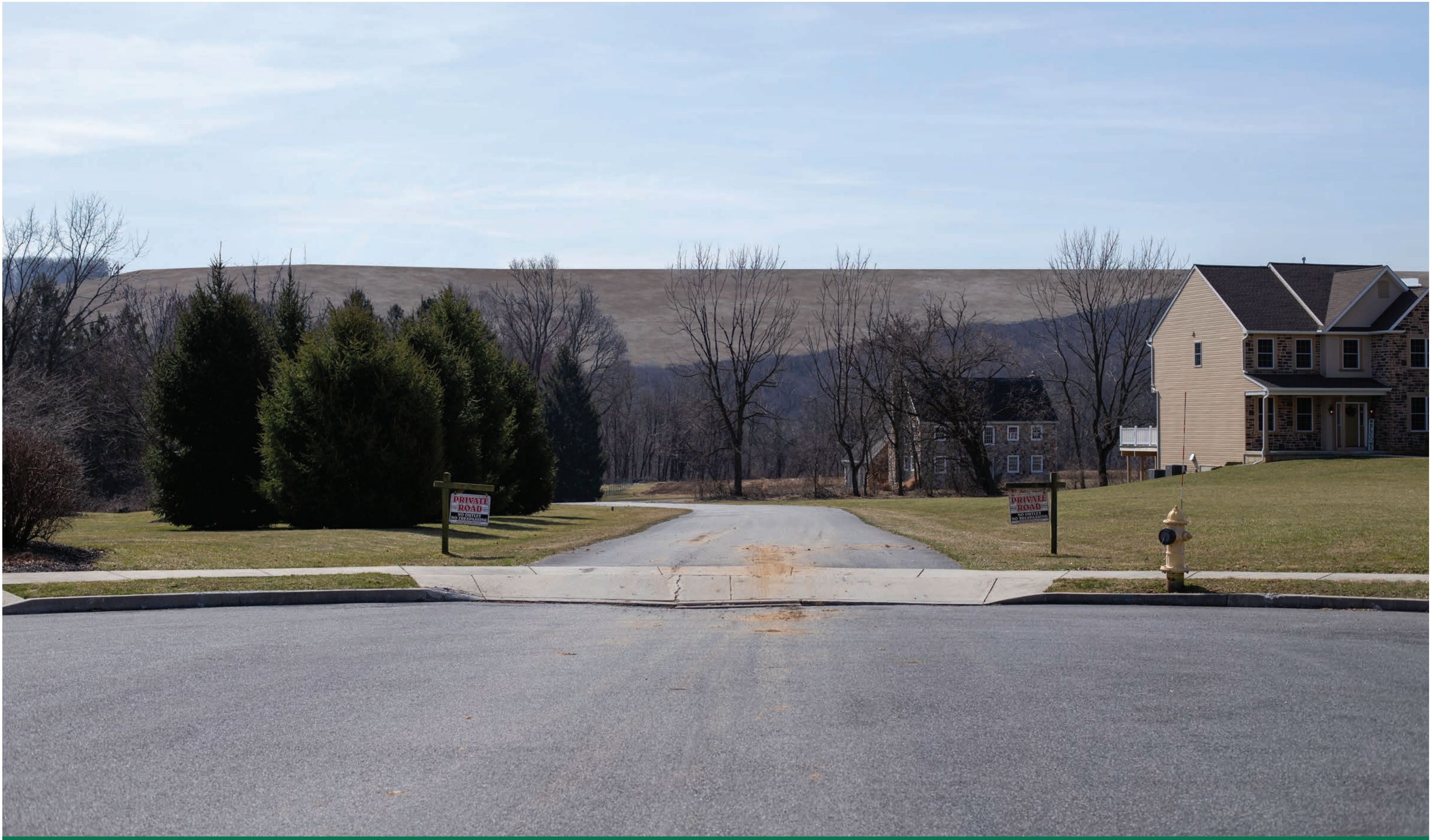
SIMULATED CONDITION: PROPOSED EXPANSION (Final Cover) Photo 06: Chardonay Dr. at cul-de-sac Distance to proposed landfill ridge: 0.92 miles