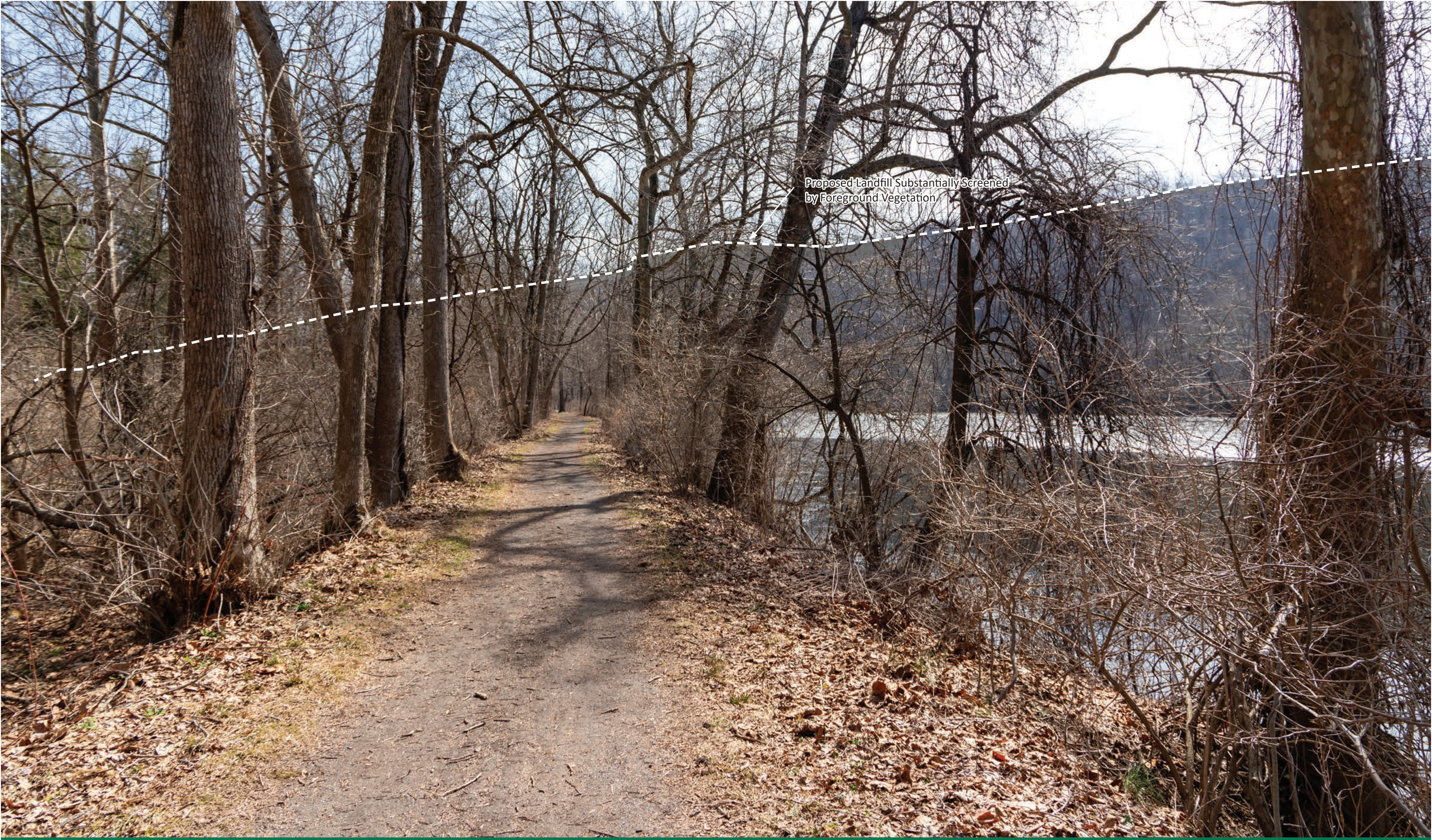
SIMULATED CONDITION: PROPOSED EXPANSION (Final Cover) Photo 10: Delaware & Lehigh Trail Distance to proposed landfill ridge: 0.49 miles