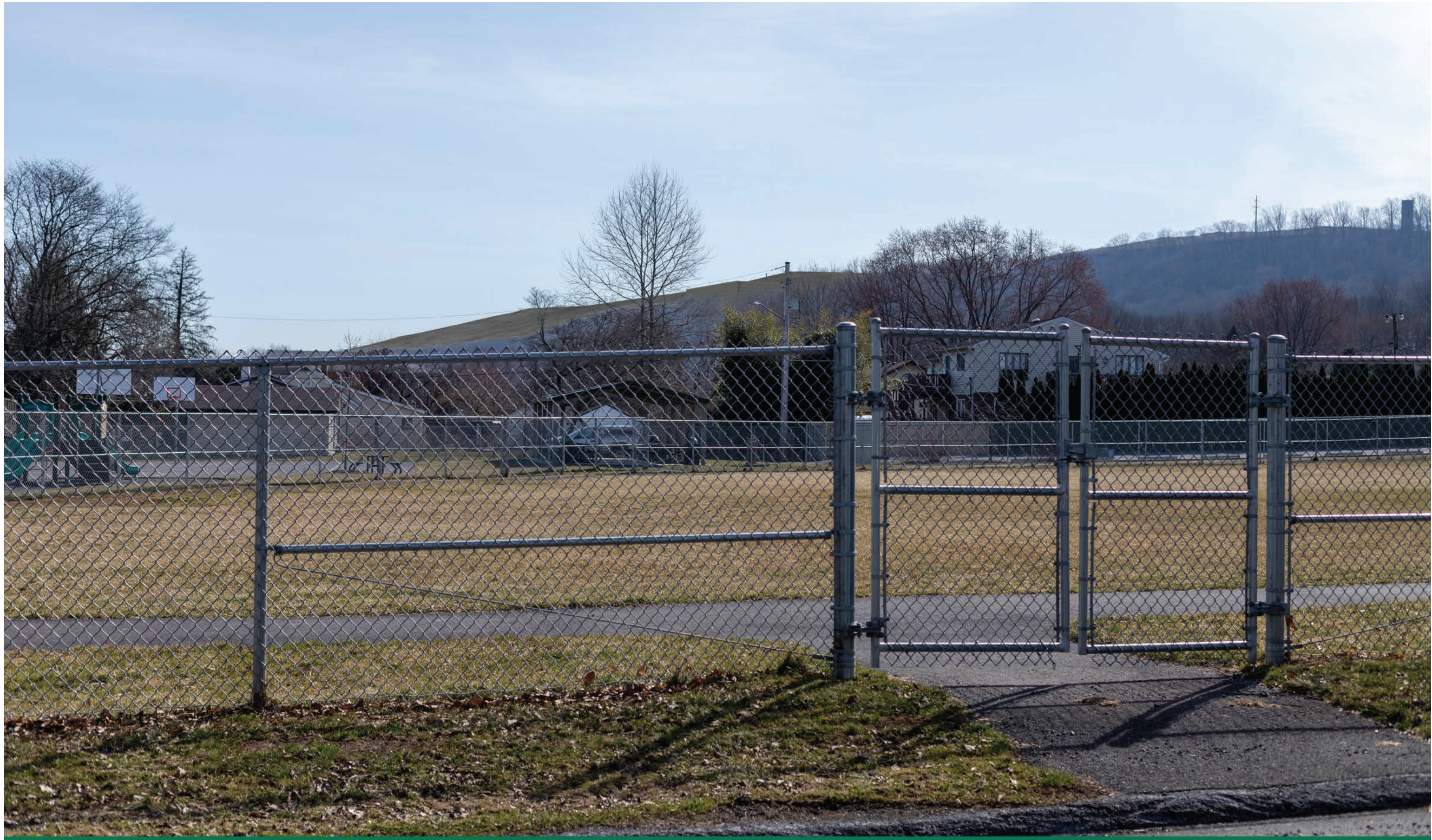
SIMULATED CONDITION: PROPOSED EXPANSION (Final Cover)