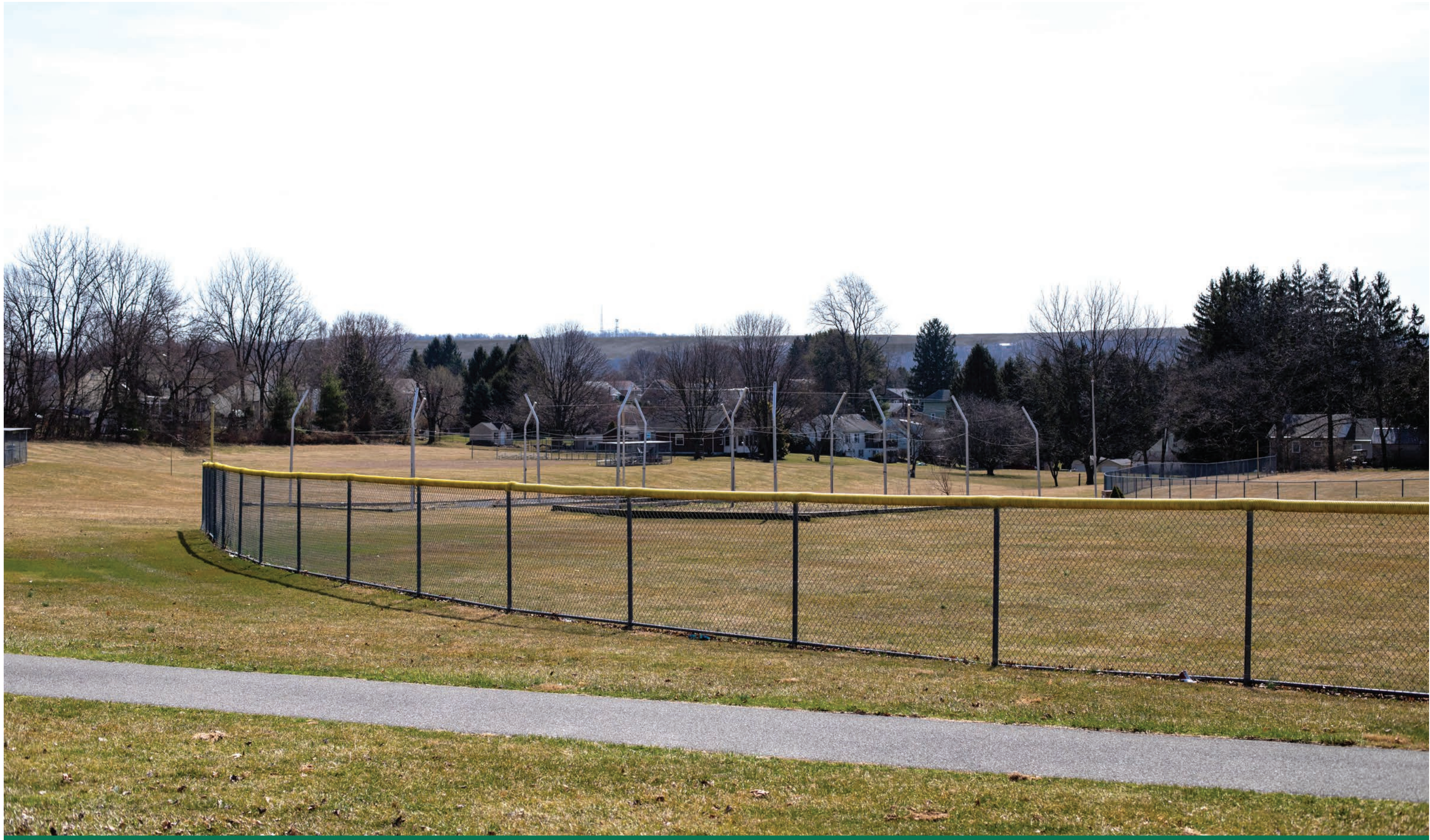
SIMULATED CONDITION: PROPOSED EXPANSION (Final Cover) Photo 01: Klein St. at Miller Heights Elementary School Distance to proposed landfill ridge: 1.81 miles