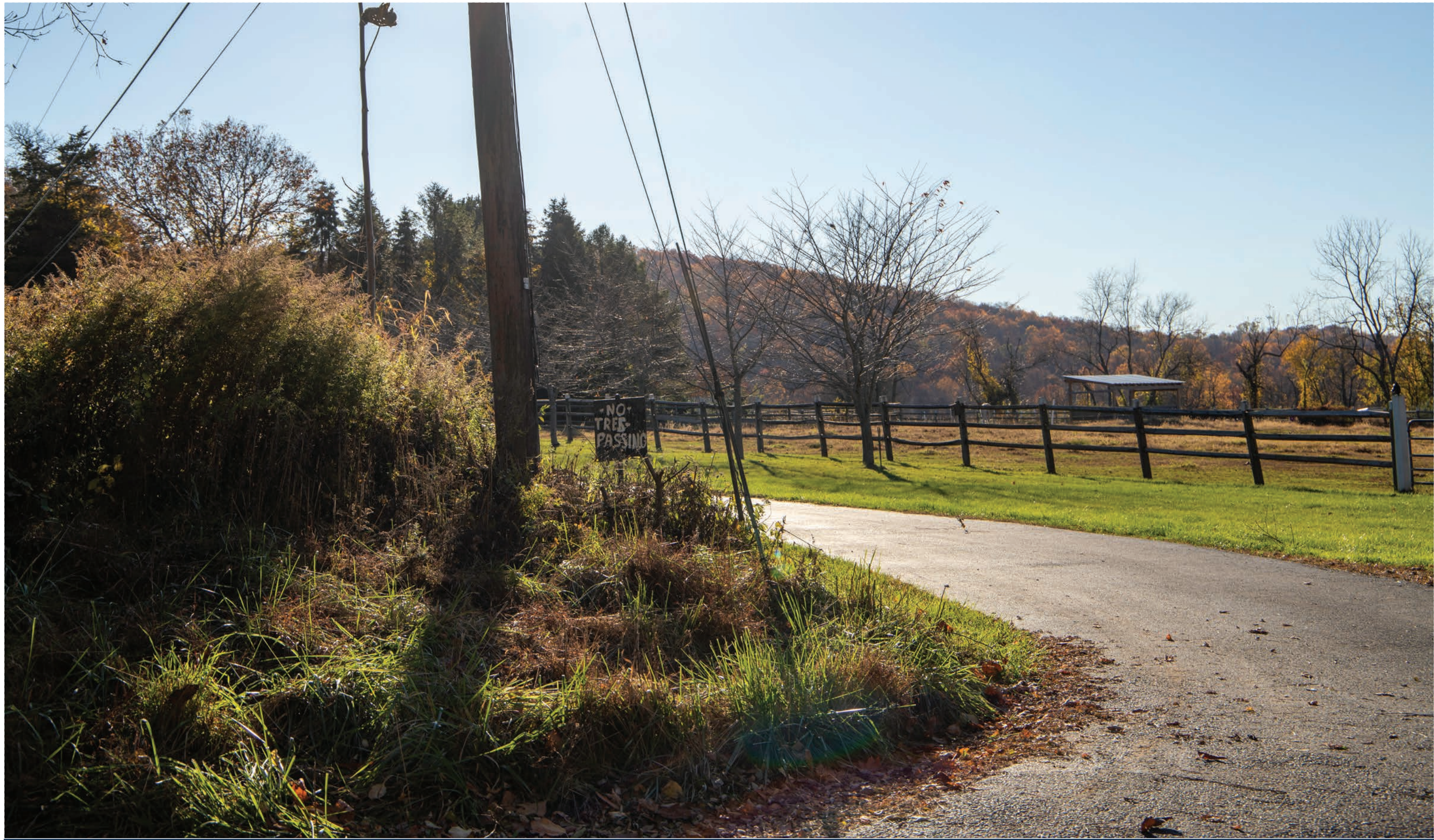
EXISTING CONDITION VIEW Photo 14: Redington Rd. near #2626 Distance to proposed landfill ridge: 0.81 miles