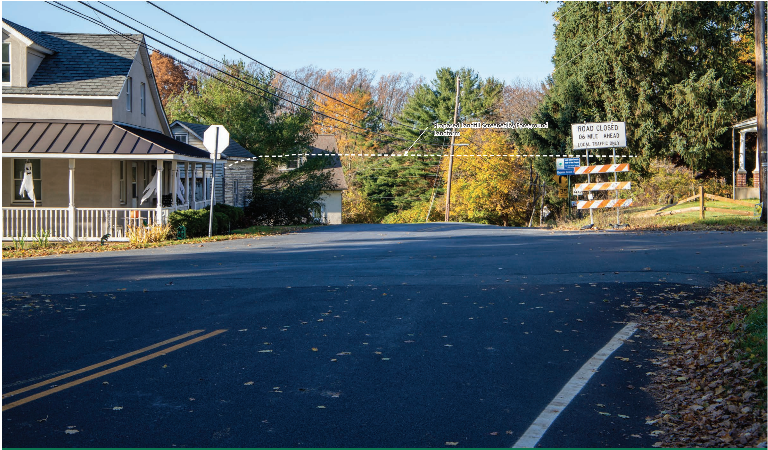
SIMULATED CONDITION: PROPOSED EXPANSION (Final Cover) Photo 17: Bergey's General Store - Lower Saucon Rd at Wassergrass Rd Distance to proposed landfill ridge: 2.88 miles