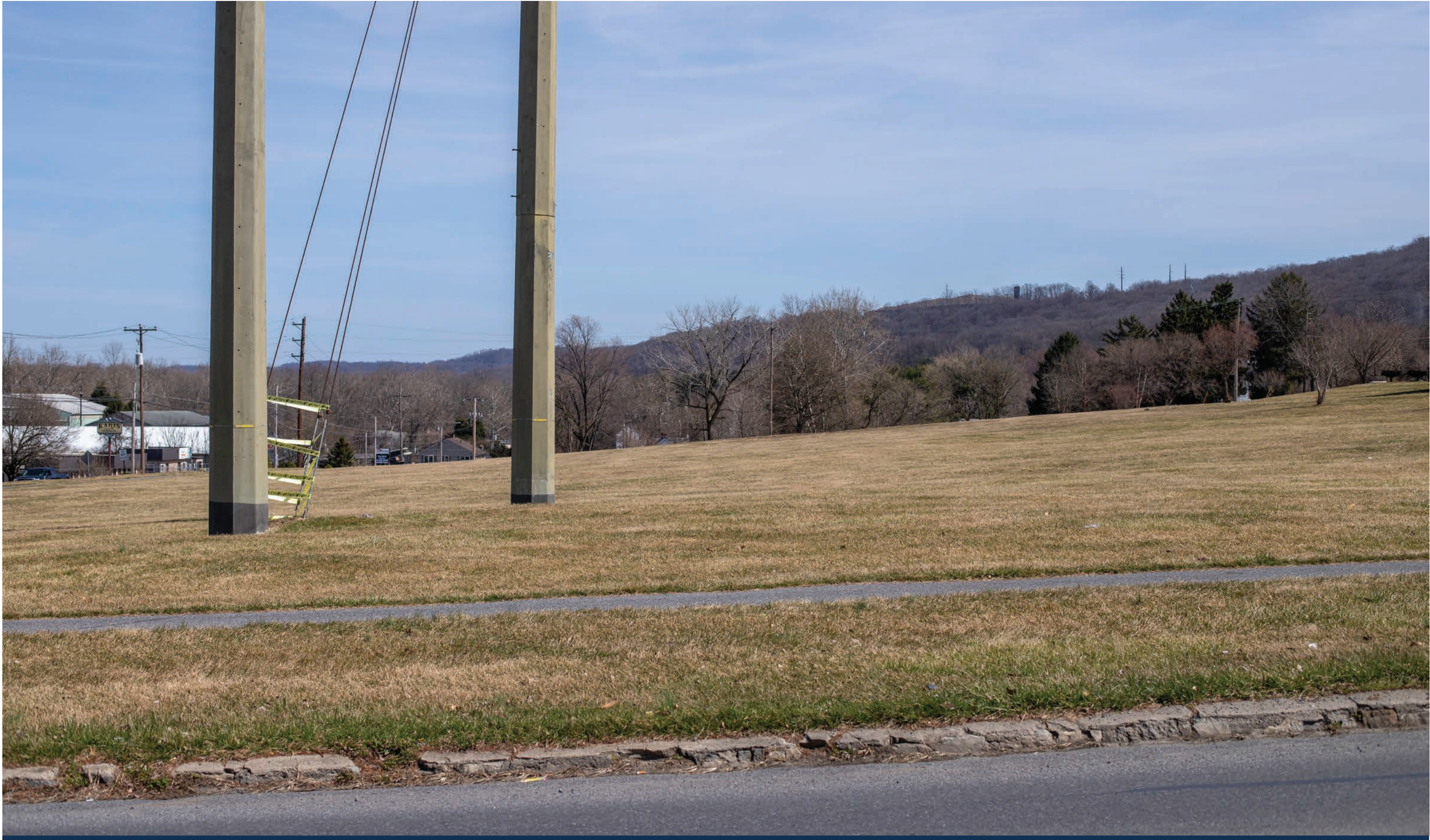
EXISTING CONDITION VIEW Photo 07: Cambria St. at Freemansburg Municipal Park Distance to proposed landfill ridge: 1.57 miles