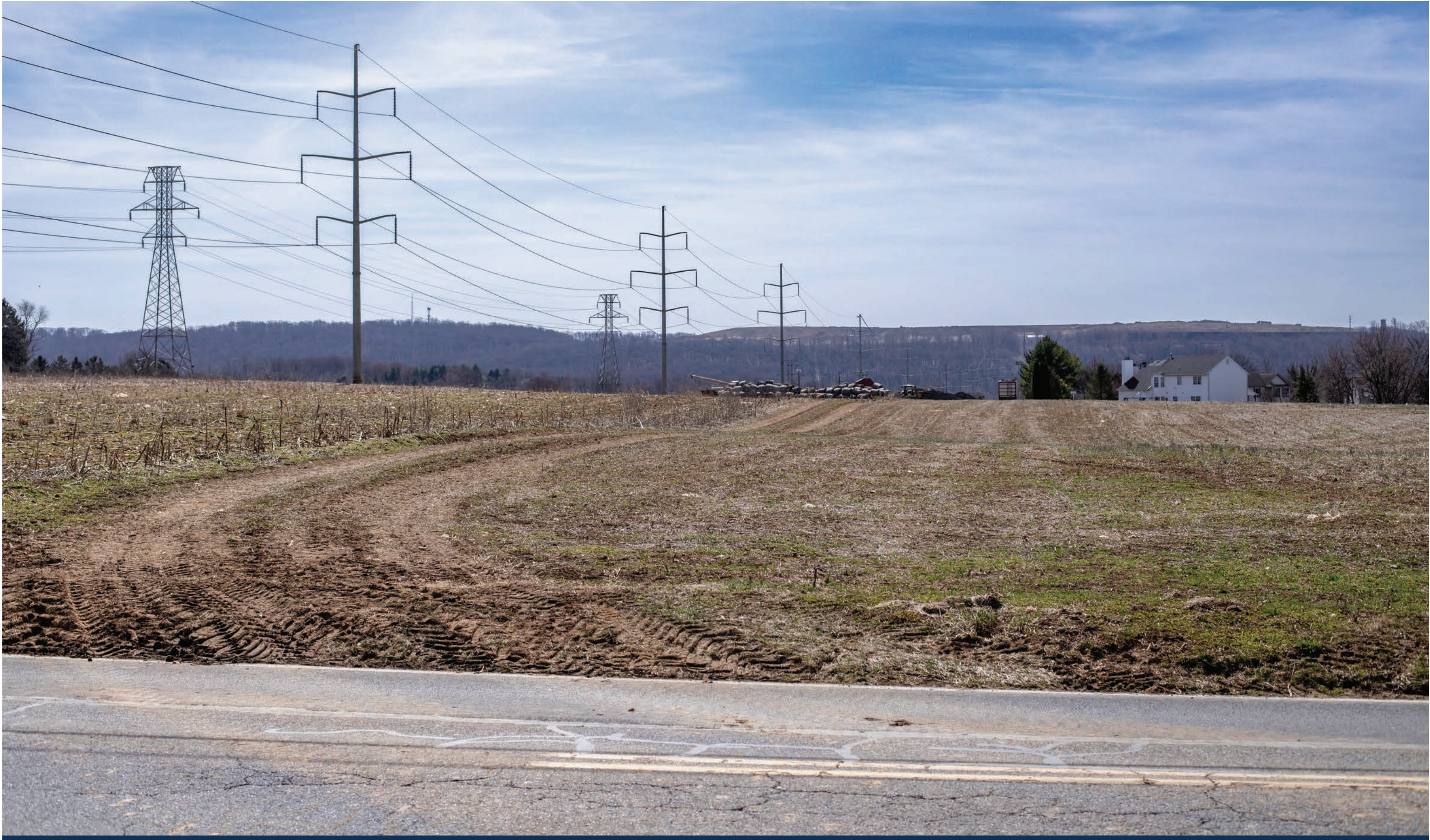
EXISTING CONDITION VIEW Photo 02: Carter Rd at Sapphire Ln Distance to proposed landfill ridge: 1.95 miles