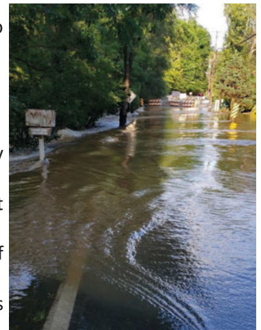
Meadows Road after Tropical Storm Isaias